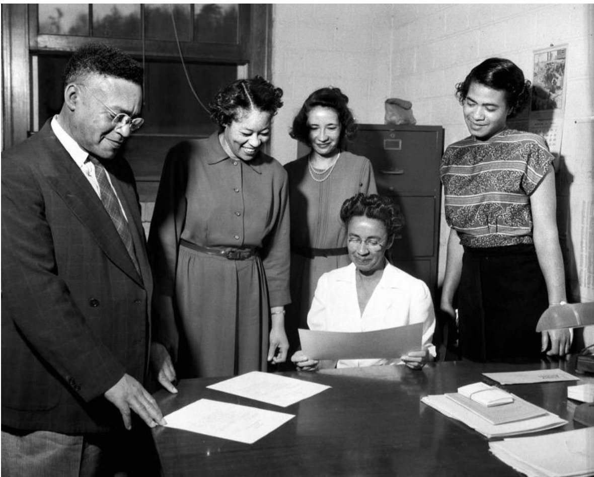
Scarboro School teachers pose with Arizona Officer, principal seated.

I am proud to have been selected to serve on the Tennessee Schools Social Studies Standards Review Committee which selected the Scarboro 85 story as one that should be taught in EVERY school in the state. The Scarboro 85 monument being designed now, and funds being raised for its construction will enable Oak Ridge to be placed on the Civil Rights Trail and the Scarboro 85 will be appropriately recognized in museums and civil rights tourism locations across the nation.